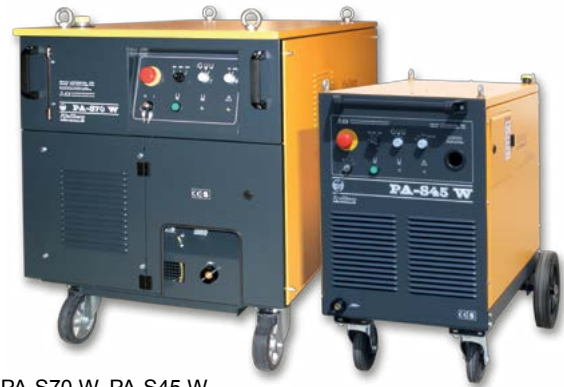
PA-S70 W, PA-S45 W

As portable systems, they can be used in workshops, training centres and on construction sites.