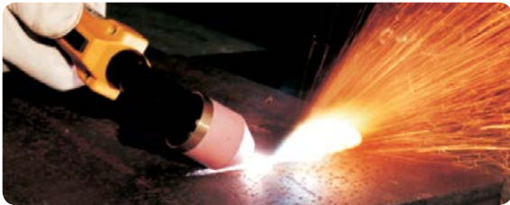
Plasma gouging with hand torch

Both the machine and hand torches can be quickly converted for plasma gouging. All you need to do is exchange the nozzles and fit the ceramic cap (with protector where necessary). The use of a range of different plasma gases and gas mixtures allows the machining of all electrically conductive materials, such as mild steel and stainless steel, aluminium and brass.