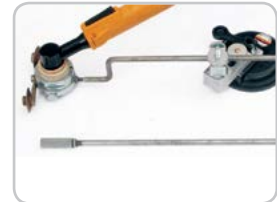
Circle cutting attachment