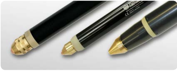
Machine torches PB-S44 W, PB-S45 W, PB-S70 W

An essential requirement for the quality of cut surfaces is the proven design of the torch's cathode and nozzle. The liquid cooling of the plasma fine-jet torch guarantees longer consumable life. Plasma cutting with the systems in the PA-S series is more efficient by increasing the productivity of the user. For the cutting of mild steel with the PA-S45W, a swirl gas torch allows more frequent piercing.