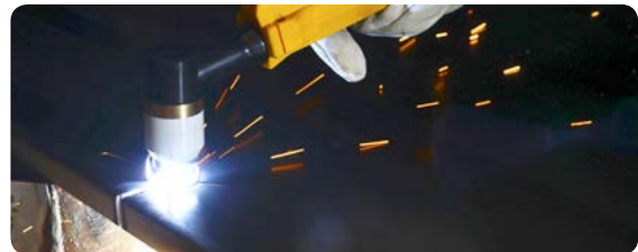
Manual cutting with PB-S45 WH