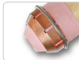
Protector for plasma gouging