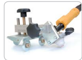
Bevel cutting attachment